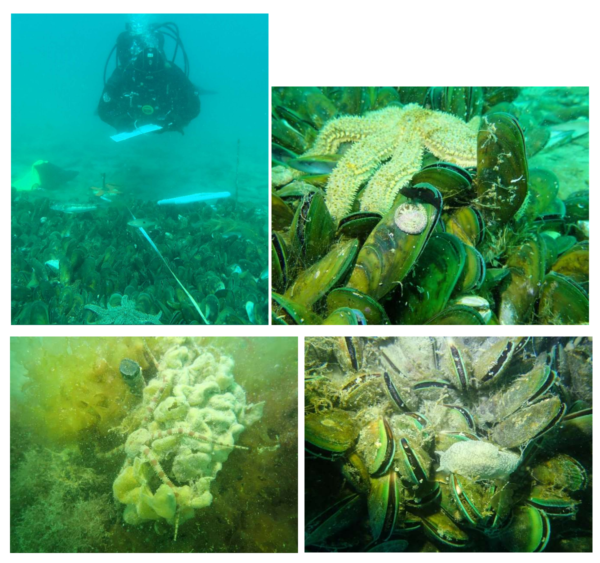
Figure 2: Top Left- Diver performing the October sampling on the mussels, while a blue Cod and spotty swim over the mussel bed at Grant Bay. Top Right- A triple fin, sea snail, and an 11-armed starfish on the mussel bed at Grant Bay. Bottom Left: A brittle star resting on some algae that is covering the mussel bed at the Skiddaw site. Bottom Right: A sea slug (nudibranch) crawling along the mussel bed at Weka Point.