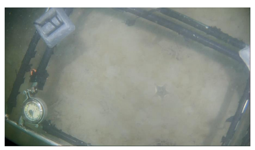
Figure 3: This is a photoquadrat of the bottom habitat at the Kenepuru Entrance location.