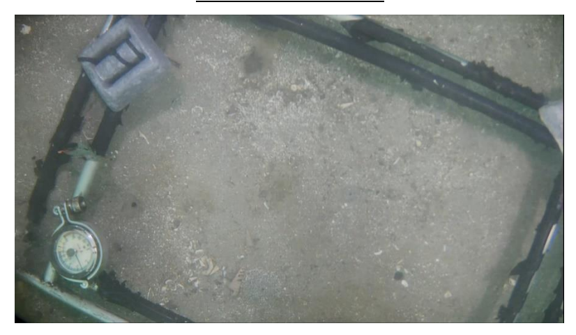
Figure 2: This is a photoquadrat of the bottom habitat at our Fairy Bay location.