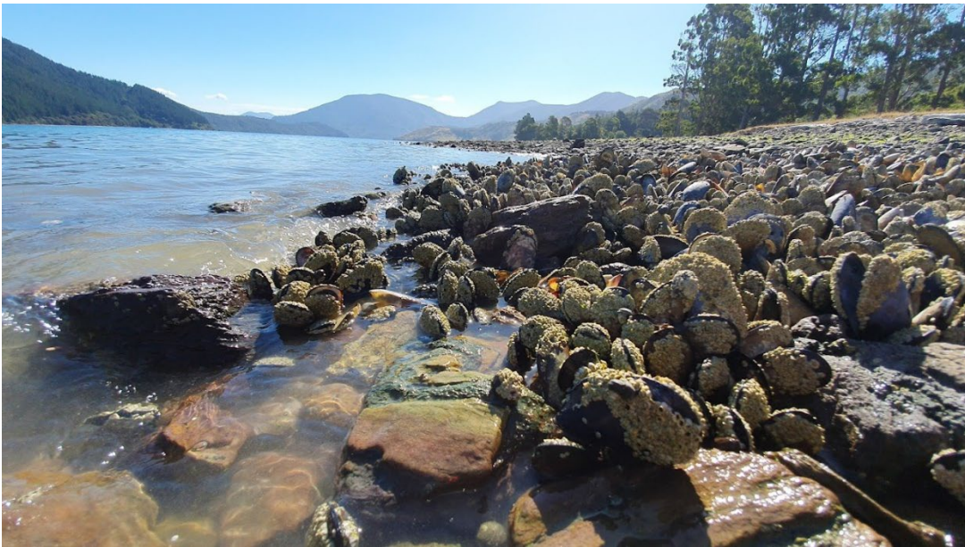
Figure 2: Intertidal mussel plot at Skiddaw.

As always, if you have any questions or comments on this project, please feel free to reach out to Emilee Benjamin via email at egol669@aucklanduni.ac.nz .