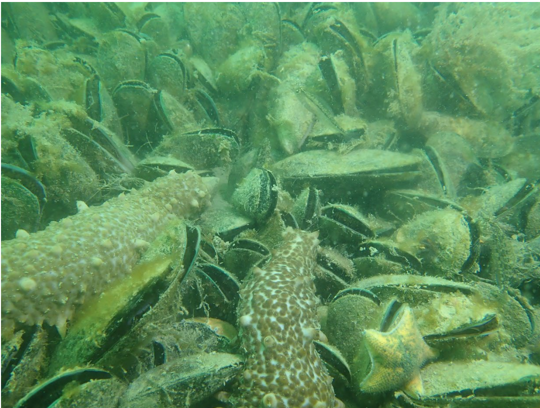
Figure 3: Subtidal mussel plot at Double Bay.